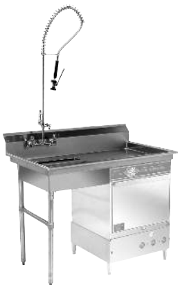
48" Undercounter dishtable with Pre-Rinse