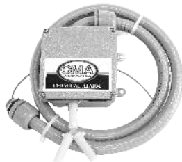
Low Chemical Alarm